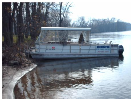
River Boat - 26' Custom Heated & Enclosed